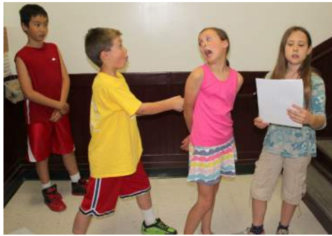
Fourth graders rehearse "The Tale of Despereaux"