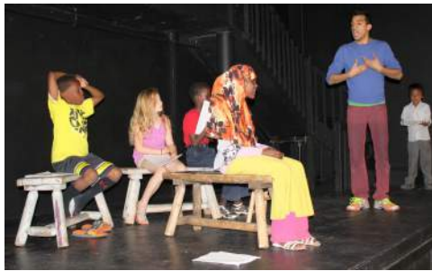
Fourth graders rehearse "Going North" at Very Merry's Stage 333