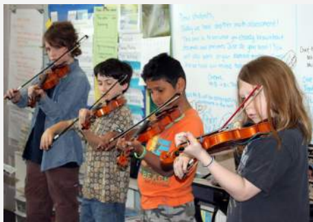
Images from the 5th grade Chamber Recital